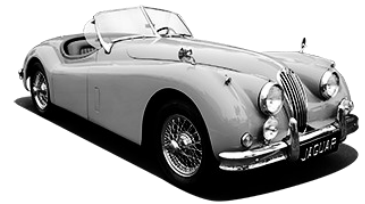
1956 Jaguar XK 140 MC OTS